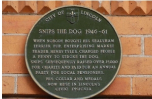
Market trader's dog, Cornhill - removed Nov 2017