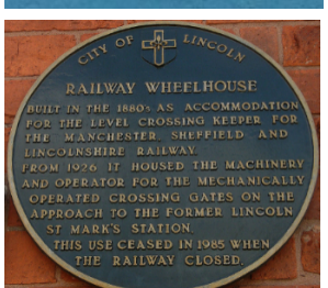
Railway Wheelhouse – High Street