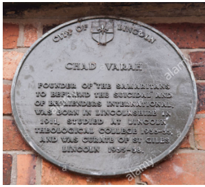
Chad Varah House, off Steep Hill