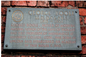
George Boole, mathematician - Pottergate